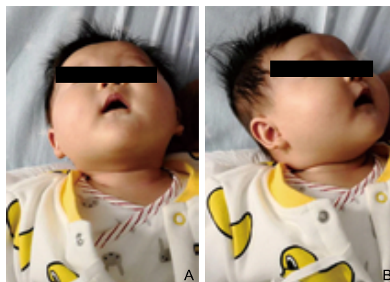
Figure 1 A 8-month-old boy with the neck symmetrically supine (A) and extended to left to maximum angle (B). The examination area was fully exposed, and the probe was transversely (A) and longitudinally (B) scanned along the SCM muscle.

area was fully exposed, and the probe was transversely (Fig. 2A) and longitudinally (Fig. 2B) scanned along the SCM muscle. Local thicker gel should be used during the examination. Minimal pressure should be applied. First, to display the conventional B-mode imaging, measure the thickness of the SCM muscle in the longitudinal section and transverse section. Then turn on the shear wave mode (Fig. 2C and Fig. 2D) and the strain mode (Fig. 2G and Fig. 2H). After the image is stable, freeze the image and measure the value to obtain shear wave velocity (in m/s), shear wave modulus (in kPa) (Fig. 2E and Fig. 2F), and strain ratio (Fig. 2I and Fig. 2J) of SCM muscle. Strain ratio is the relative stiffness of the SCM muscle compared to that of the subcutaneous tissue. Three consecutive measurements were performed at the same location, and the median value was calculated for statistical analysis. The results of shear wave elastography and strain elastography are shown in Figure 2.